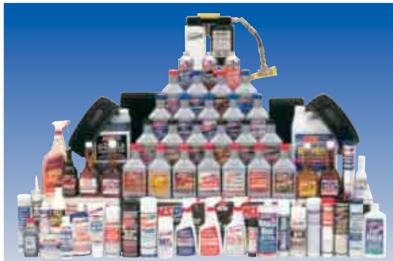
AMSOIL—A Complete Line of Farm Products

(3) Expertise: the know-how that comes from three decades of experience tailoring AMSOIL products to meet customers' needs.